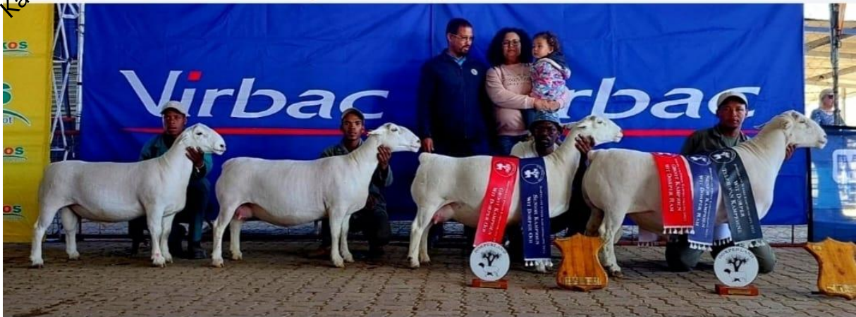
Brazil Dorperskou 2024

Senior kampioen ram en grootkampioen ram. Senior kampioen ooi, reserwe senior kampioen ooi. Groot kampioen ooi en Reswerwe grootkampioen ooi. Reserwe junior kampioen ram