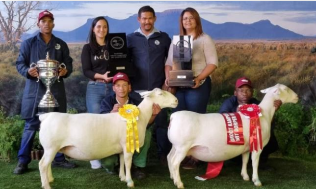
SA Dorper Wêreld Kampioenskappe 2022