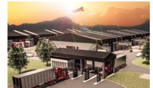
TRADE PORT & FREEPORT PARK